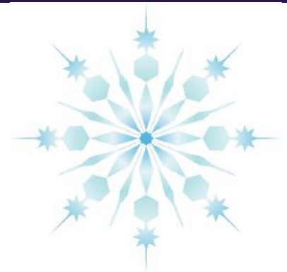
Winter Social February 25