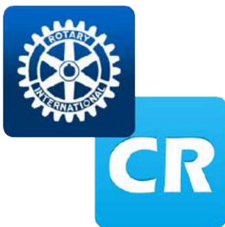
Wes Brooks - ClubRunner March 4