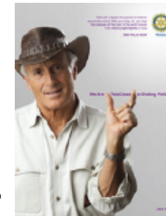
Jack Hanna is a participant in Rotary's "This Close" polio awareness campaign.

Jack Hanna, director emeritus of the Columbus Zoo in Ohio, USA, is best known as the star of the syndicated television series Jack Hanna's Into the Wild . But he has also been recognized for his work rehabilitating victims of the genocide in Rwanda. Hanna, a participant in Rotary's "This Close" polio awareness campaign, spoke to RI News about his family's experience with polio, and the importance of Rotary's efforts to eradicate the disease.