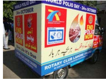
Rotarians are getting ready to spread the word about World Polio Day, 24 October, and the need to finish the job of eradicating the disease.

Rotarians around the globe are planning events to raise polio eradication awareness and funding for World Polio Day on 24 October.