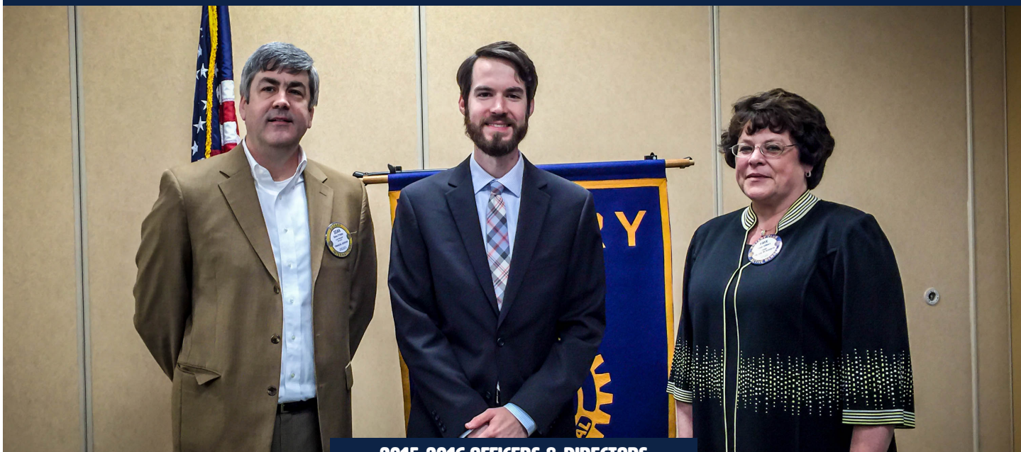
2015-2016 OFFICERS & DIRECTORS