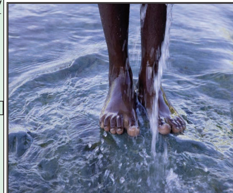
Water and sanitation is one of Rotary's areas of focus. Worldwide more than 800 million people lack access to clean drinking water.