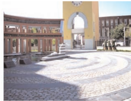
Fall District Conference and Musical Food fest Downtown New Orleans at the fabulous Piazza d'Italia