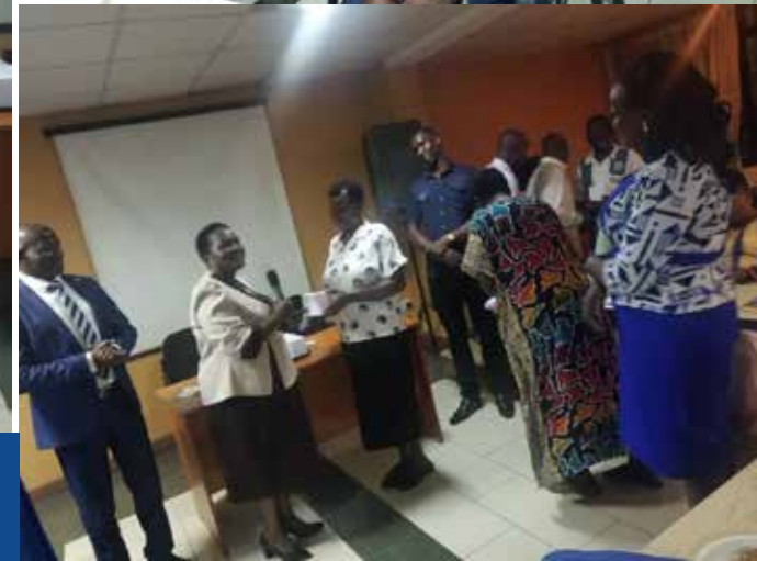
MONDAY THURSDAY FELLOWSHIP MOMENTS