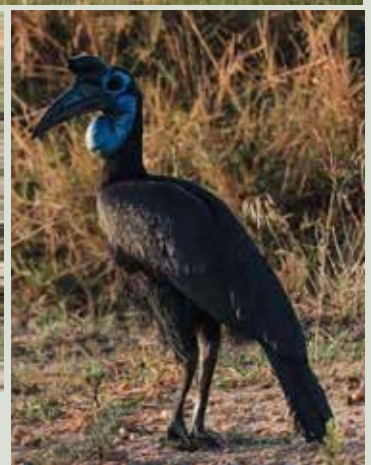
The Abyssinian Ground Hornbill