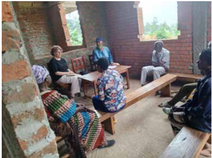
Community Assessment meeting