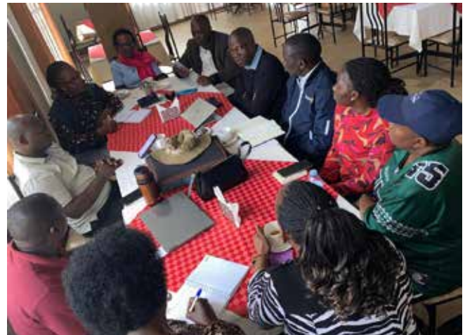
Club Board Meeting on 17th August at Jevina Hotel