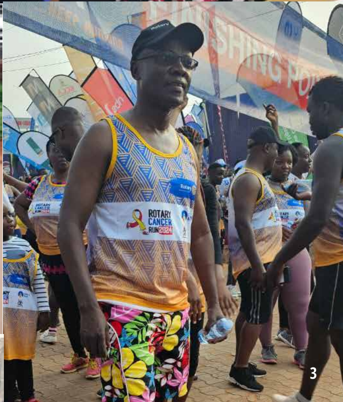
3 CLUB PN/ TREASURER RELAXING AFTER 5KM