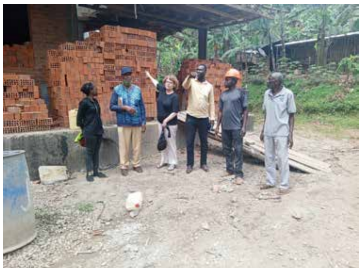
Exhibiting factory made bricks