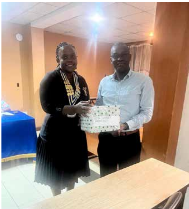
President Bulya gives out gifts to babies of the month