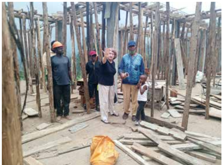
Listening to an explanation from one of our International Partners