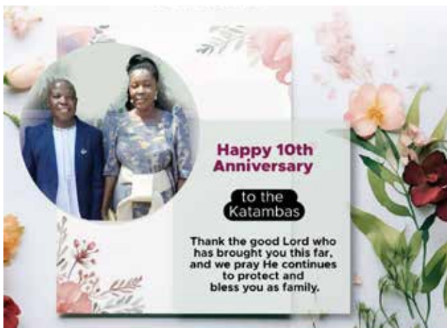
Member Wedding Anniversary