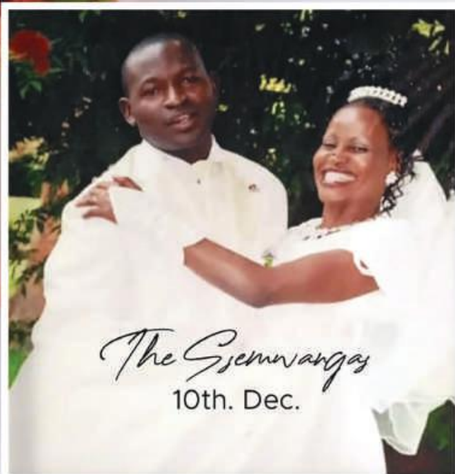
The Semwargas 10th. Dec.

Your everlasting love is an inspiration to us all