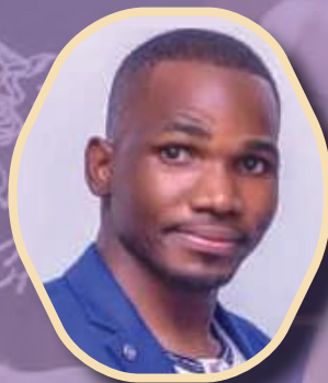
RTN. SALIM SSEMUJU Photographer