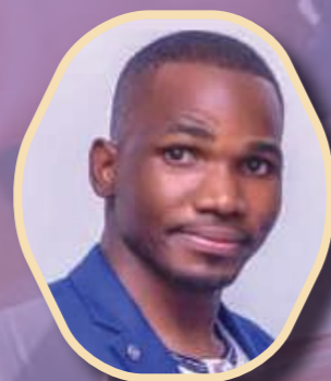
RTN. SALIM SSEMUJU Photographer