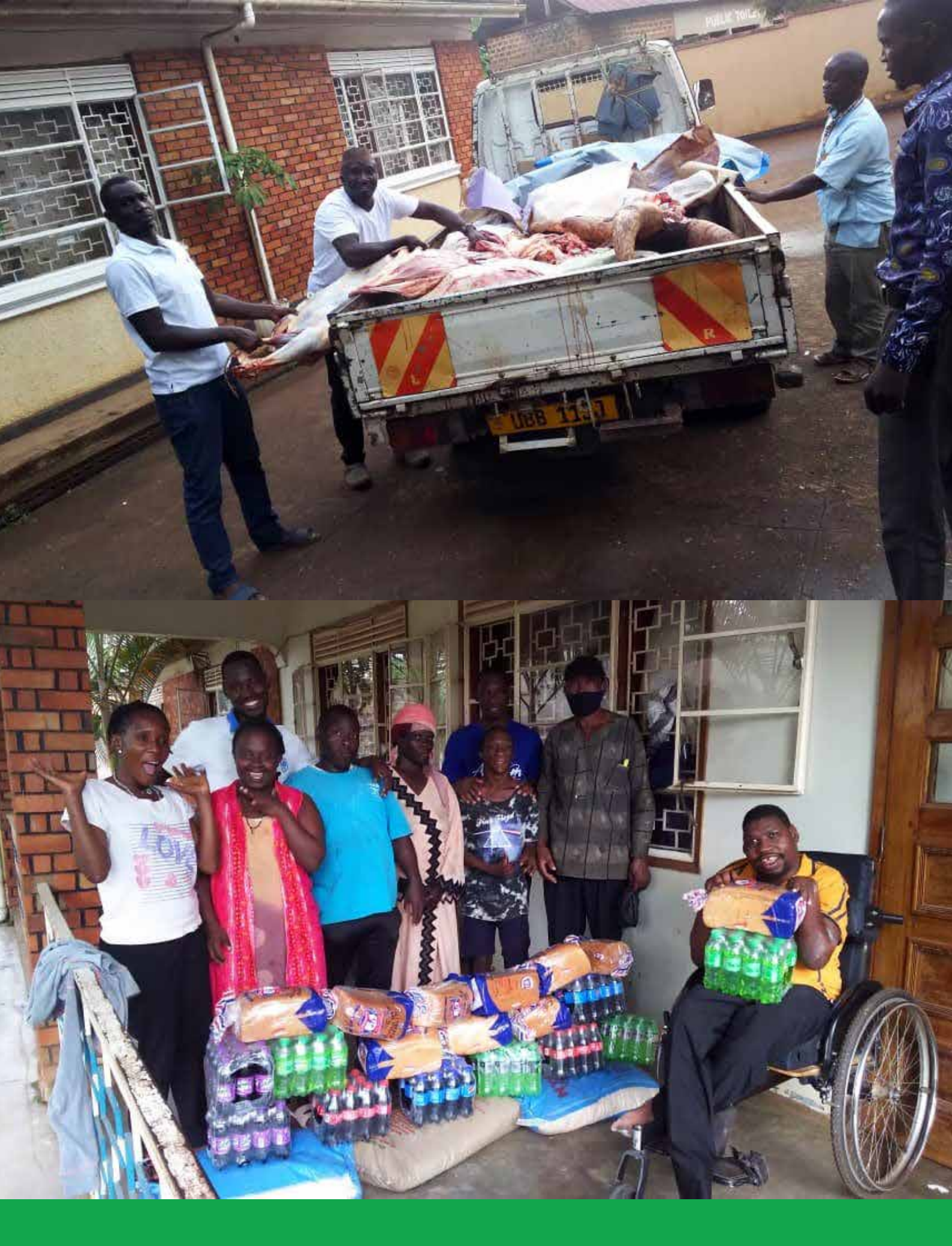
Eid Celebrations at L'ARCHE