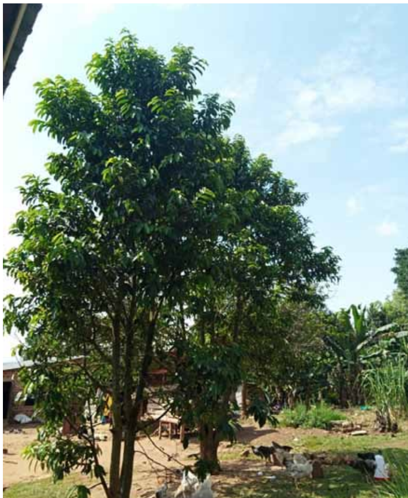
TOO HOT!!! Even the hens in the village get their rescue under cinnamon trees