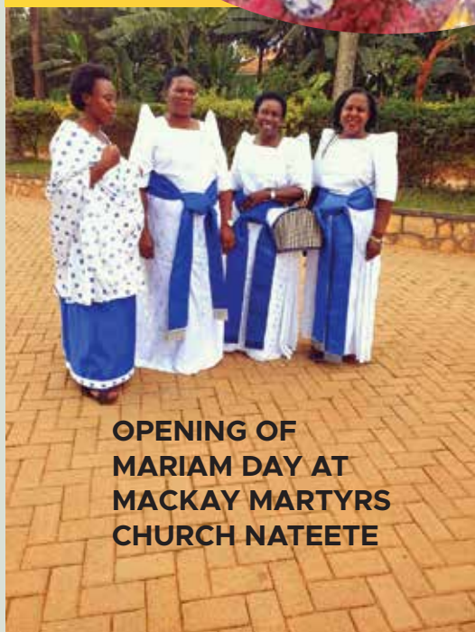
OPENING OF MARIAM DAY AT MACKAY MARTYRS CHURCH NATEETE