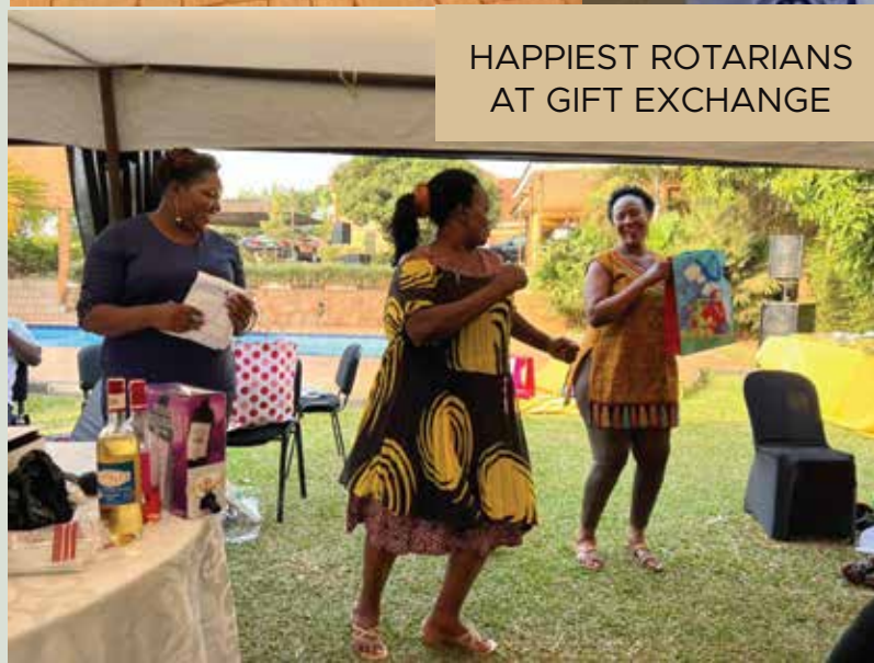
HAPPIEST ROTARIANS AT GIFT EXCHANGE