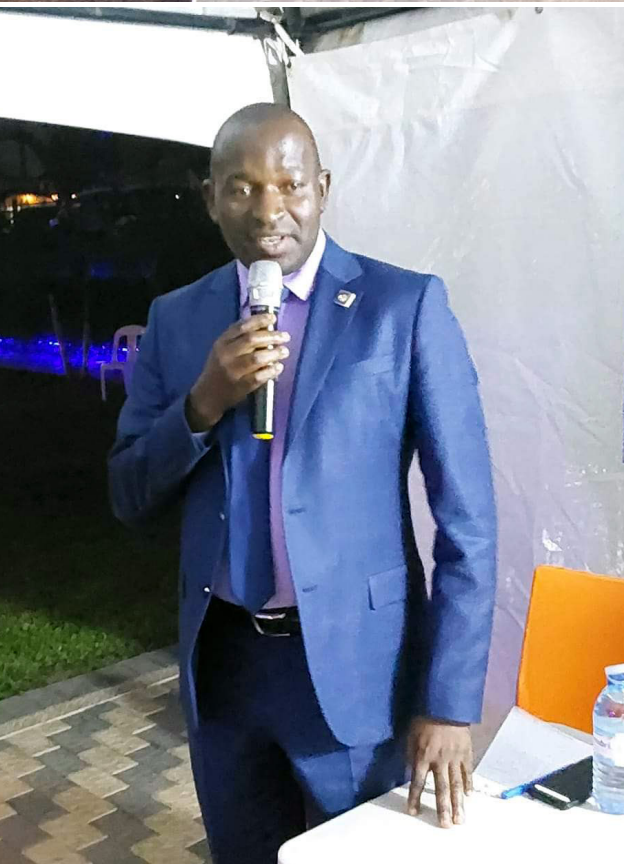
Preparing our first meeting for RC Lungujja in formation and during the meeting.