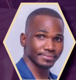
RTN. SALIM SSEMUJU Photographer