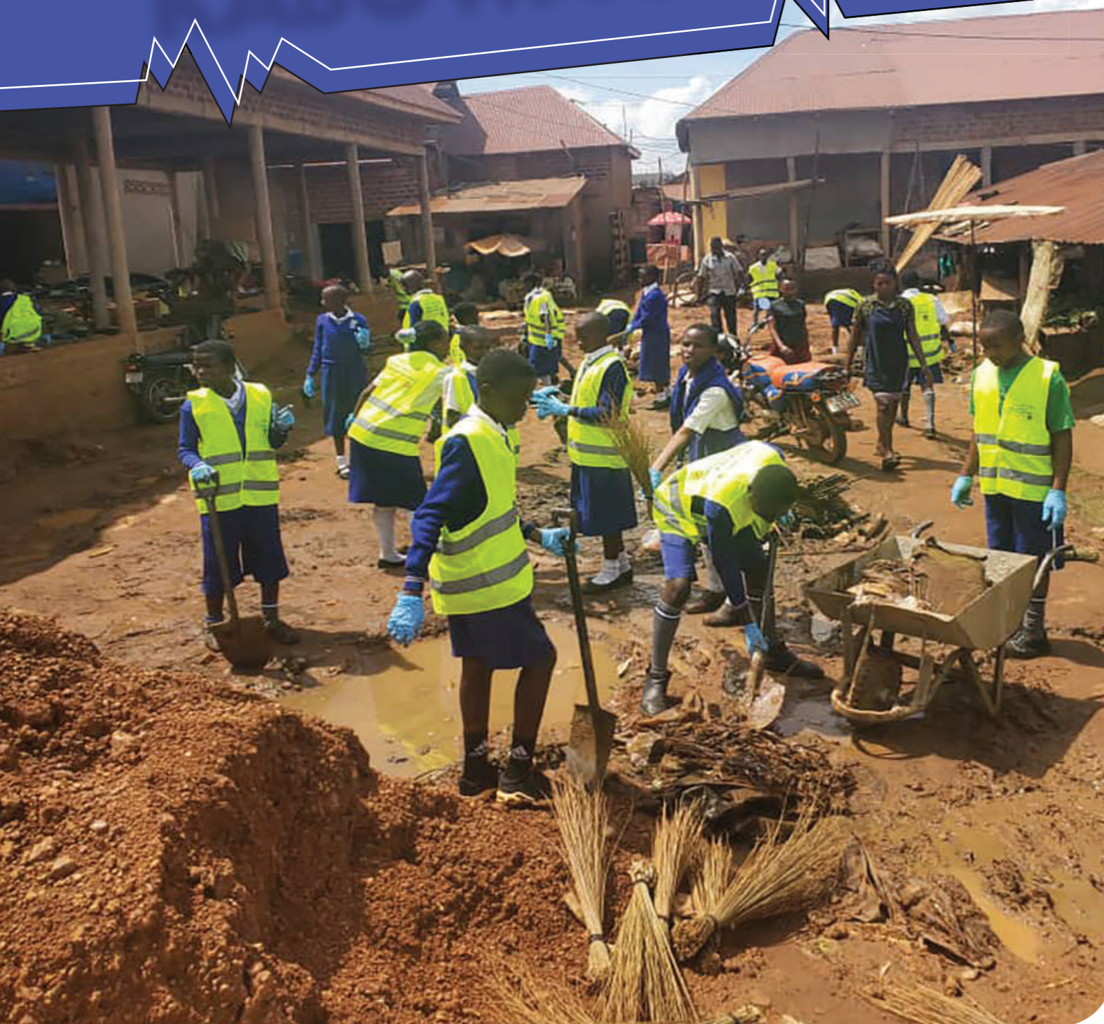
Rotaractors of Kabowa in formation; in action during community service at Wankulukuku - Kampala