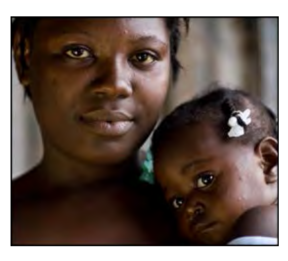
Endowment Fund To Secure Tomorrow