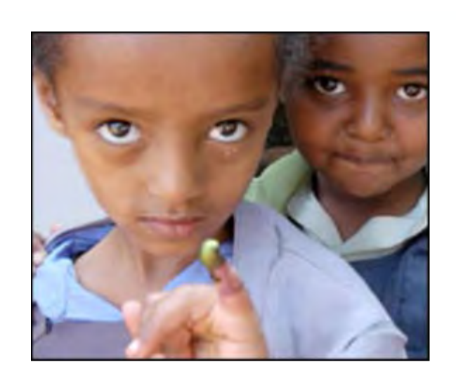
PolioPlus Fund End Polio Now