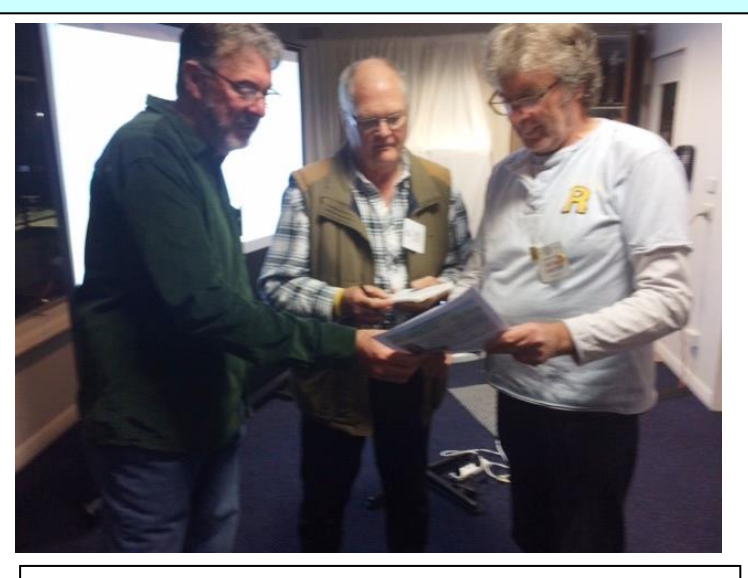
Expert group discussing the "deliberate mistake" our Bulletin Editors insert each week to gauge the reading audience of the Club Bulletin