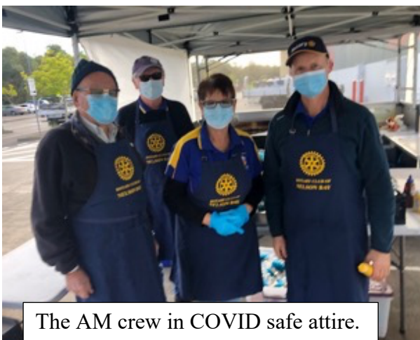
The AM crew in COVID safe attire.