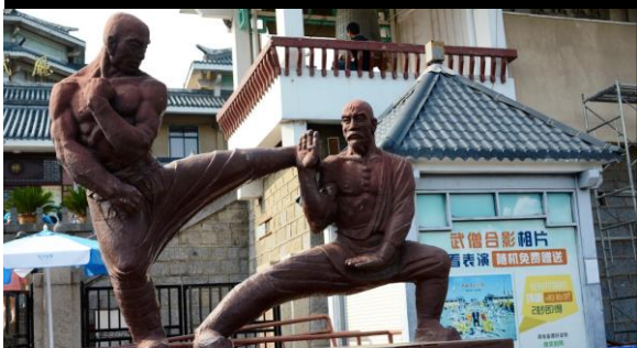
Shaolin Temple Martial Arts School