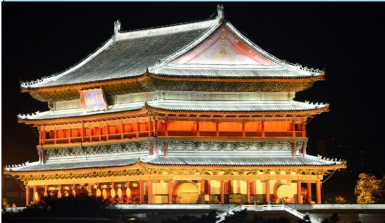
Xian Bell Tower