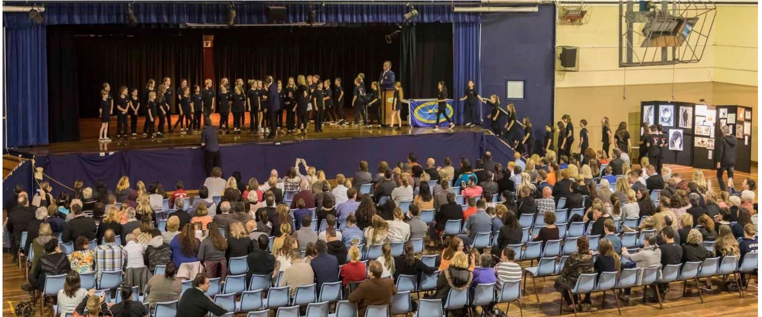
Attendees at the Education Week Awards held at Tomaree Education Centre