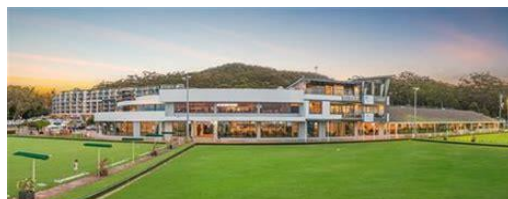
Nelson Bowling Club – Still Closed