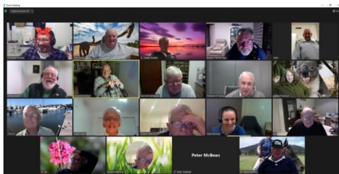
ZOOMING IN- MORE PIX PG 3

Remember the days!!!! Don't forget your mask and your mobile phone if you go out for essential supplies, i.e. wine, beer and food.