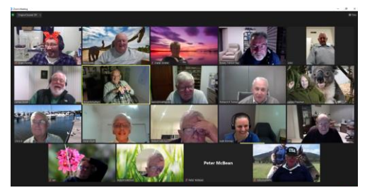
ZOOMING IN- MORE PIX PG 3

Remember the days!!!! Don't forget your mask and your mobile phone if you go out for essential supplies, i.e. wine, beer and food.