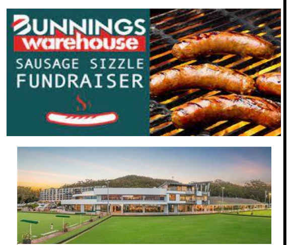
Nelson Bowling Club - Still Closed