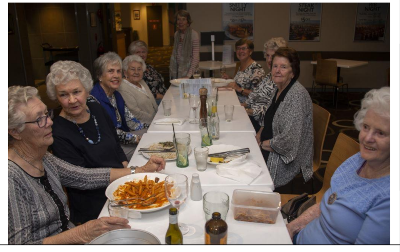
Dinner Ladies enjoying their monthly get together