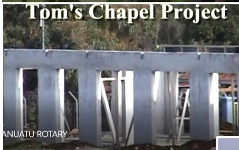
Tom's Chapel Project

Pg. 3: SES; Hat Day; World Polio Day; Christmas Party; NB Bowling Club update; Yacaaba Centre. How true!