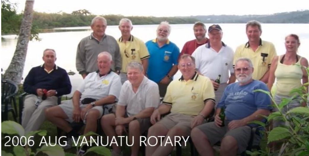
2006 AUG VANUATU ROTARY