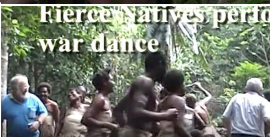
Fierce Natives perform war dance