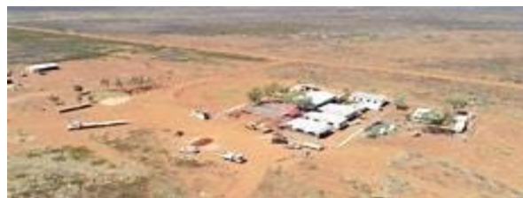
An aerial view of the Rockhampton Downs School in the Northern territory where the recent End Trachoma kits were sent. The school is located on the huge Rockhampton Downs Station some 131 kilometres from Tennant Creek... The End Trachoma project is still active, and updates will be advised in future editions of the bulletin.

The National Youth Science Forum is a competitive summer school program dedicated to exposing year eleven students who are heading into year twelve and are thinking about a career in science, engineering, etc