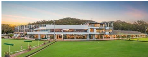
Nelson Bowling Club – Now open