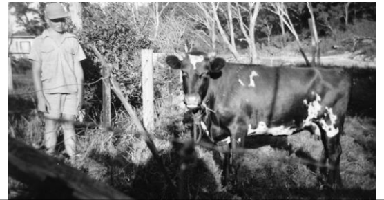
Clarabelle the famous cow that was swept down the Hunter River and out to sea in the devastating Hunter Valley flood of 1955 and somehow ended up on Broughton island.