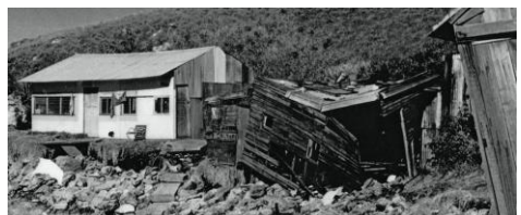
Destruction of hut by huge swell before rock wall