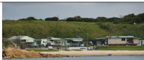
Esmeralda settlement today with ranger facility r/h