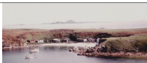
Early days of the settlement