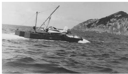
After landing a take-off was not possible and the plane had to be ferried home