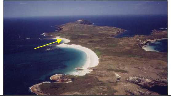
Providence Bay the location of the 2 nd Greek fishing village of the island