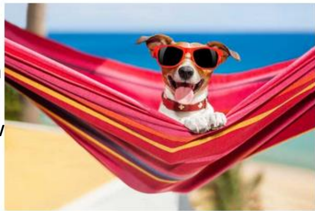
Courses to invigorate your mind, body and soul