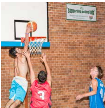
Not for the short ones...