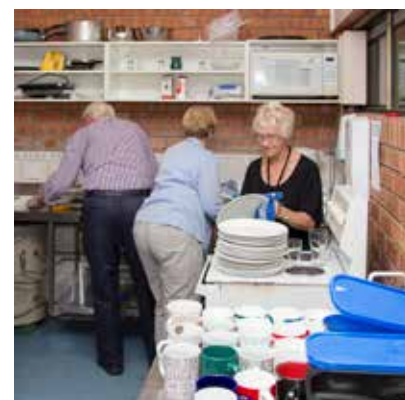
A nice meal with good company and we did not mind (watching the) washing up.....