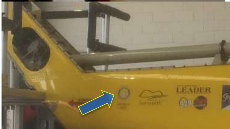
Spotted Rotary sponsor logo on tail of Westpac rescue chopper, during a recent visit at their service facility in Broadmeadow