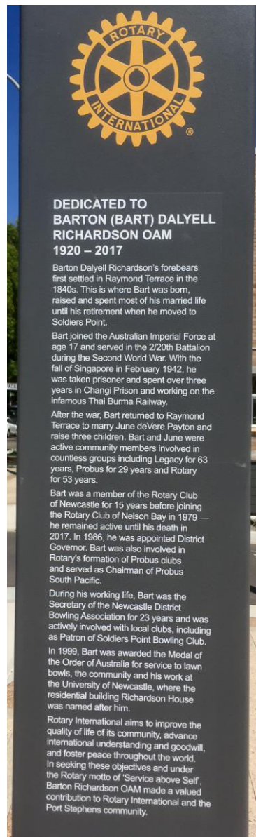
Side view Bart Richardson Dedication-scroll