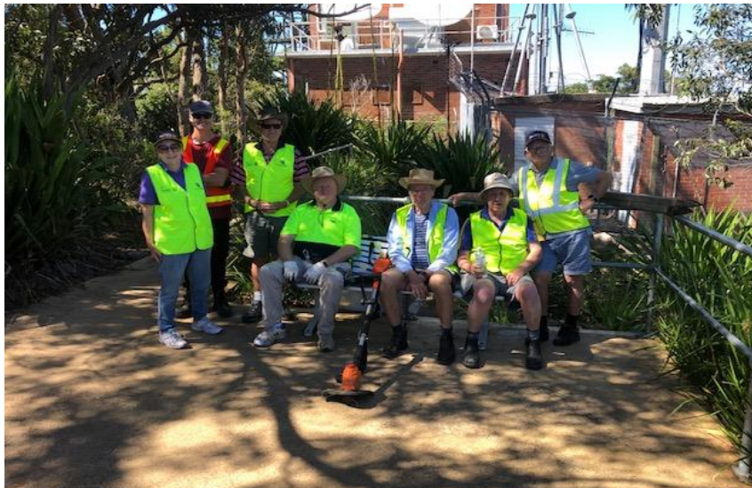
The hard-working team at Gan Gan Lookout taking a water break.