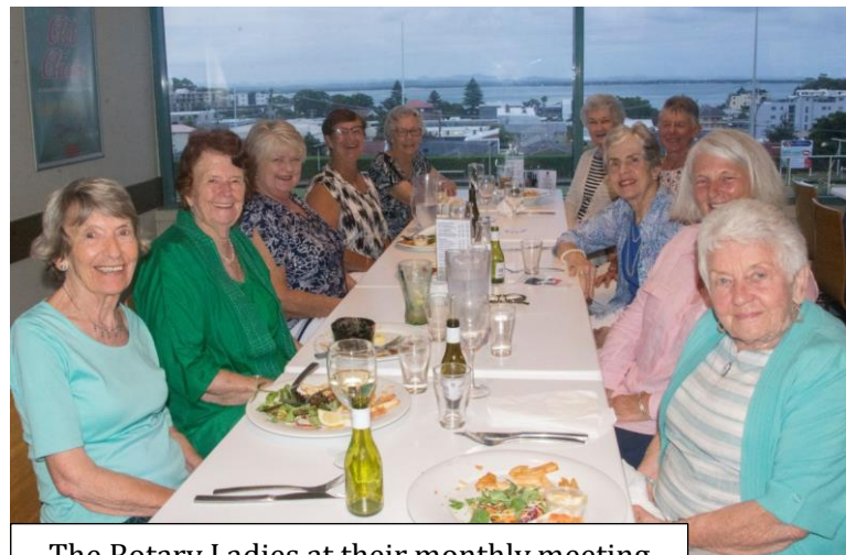
The Rotary Ladies at their monthly meeting