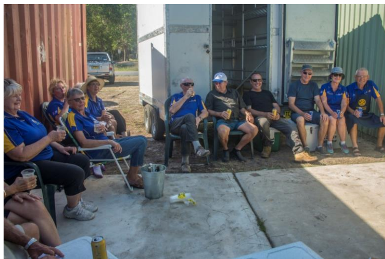
Well earned drinks after another successful Oz day event