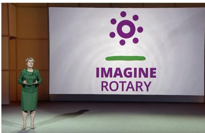
Rotary International president-elect announces 2022-23 presidential theme to district governors-elect.