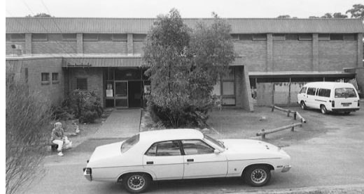
The early days of PCYC Nelson Bay

Blue Star is another youth dev. program. https://www.youtube.com/watch?v=80ISV6lco6s