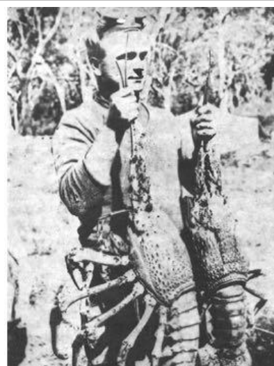
A fine lobster catch from Broughton Is.