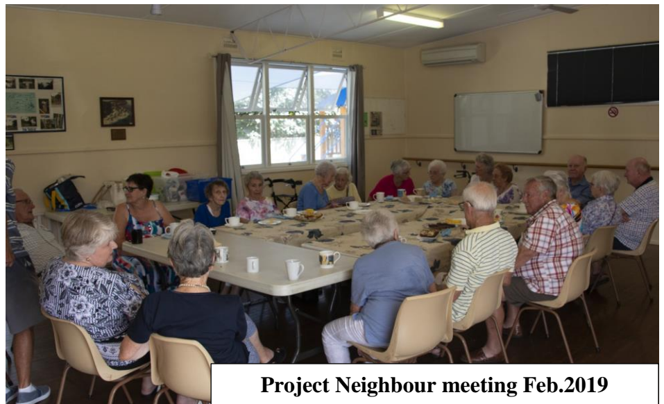
Project Neighbour meeting Feb.2019