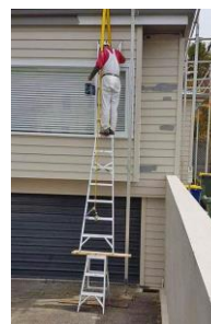
<< WH&S Fails >>