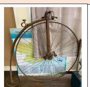
Penny Farthing 1888