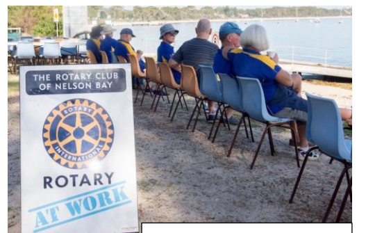
The sign says it all

Pay your dues and special dinner fees by EFT: Account name: Rotary Club of Nelson Bay Inc. - BSB: 637000 Account #: 781017418 (please, mention your name and what you are paying for.)