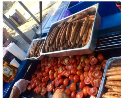
Tomatoes to complement beans