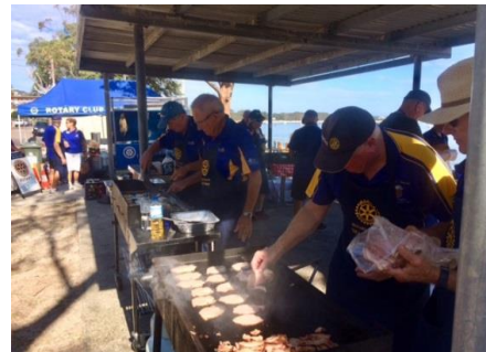
The bacon & egg flippers