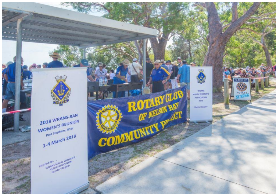
Picture shows some of the 330 WRANS personnel gathered at Shoal Bay Beach last Sunday for brunch organised and prepared by our Club. Many compliments were received both on the day and afterwards. A great team effort.