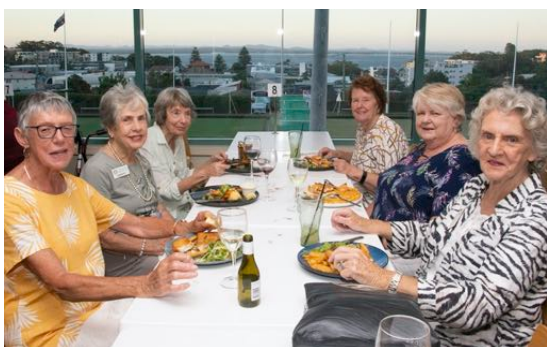
Left: The Dinner Ladies met this week being the first meeting of the month.