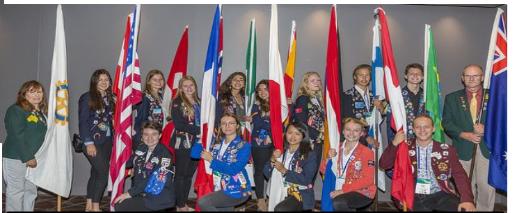
What a great bunch of Youth Exchange students who excelled over 3 days