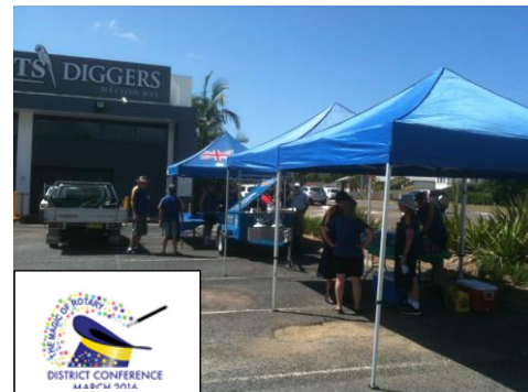
Clive's Cooker in action at the District 9675 Conference