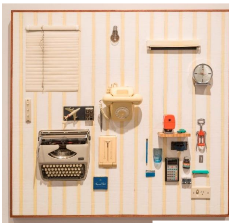
Some of the artefacts on show