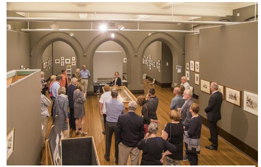
Maitland Int. Salon of Photography Exhibition (work in progress)