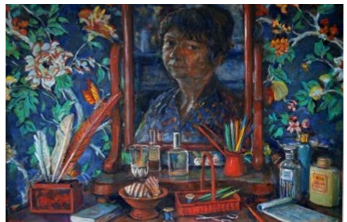
Bedroom Still Life by Margaret Olley (1923 – 2011)