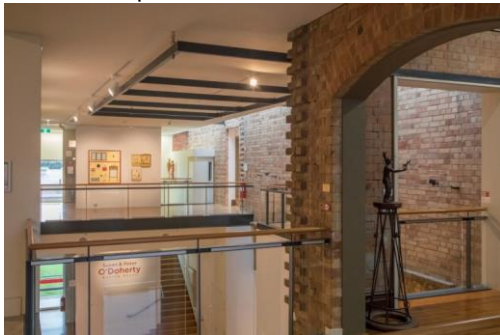
Linking old & new building