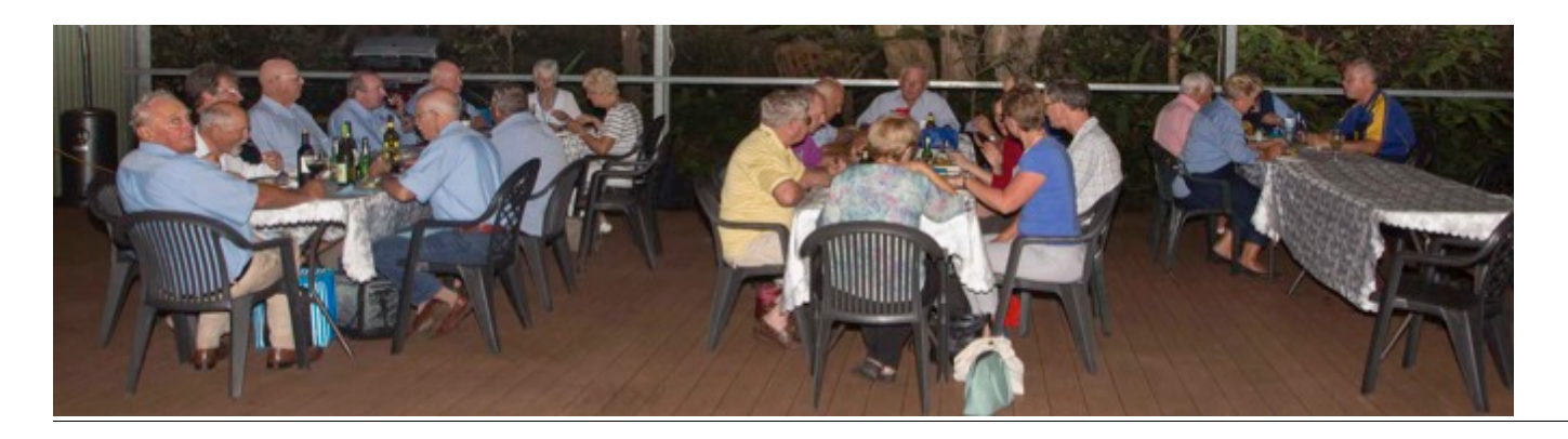
THESE LUCKY ROTARIANS ATE THIS DELICIOUS MEAL