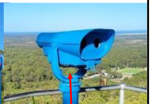
Coin mechanisms destroyed