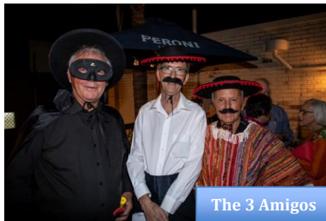
The 3 Amigos