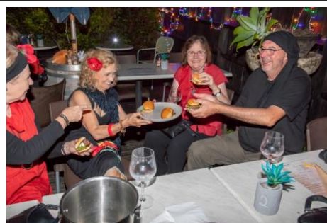
The Burgers are better at Evviva