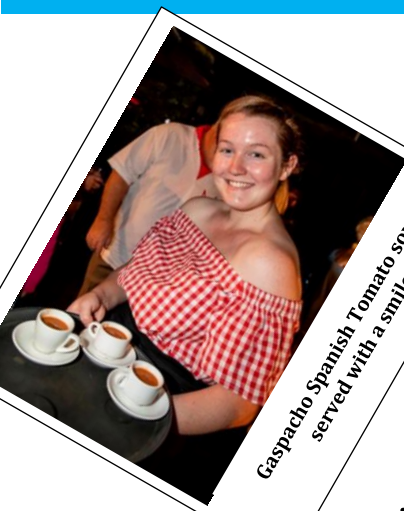
Gaspacho Spanish Tomato soup served with a smile