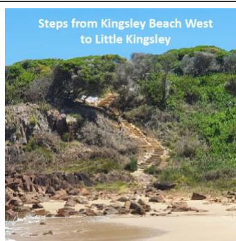
Steps from Kingsley Beach West to Little Kingsley