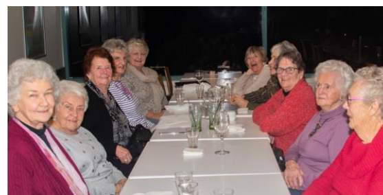
The Rotary Ladies' Monthly meeting

Meeting closed at 6.40 pm, with Don & Fiona thanked for their hospitality.