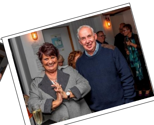
All photos complement of Henk Tobbe download the whole series of 38 from HERE