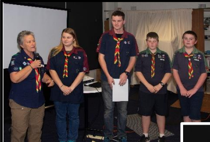
Anna Bay Scouts and Venturers thank us for our donation.