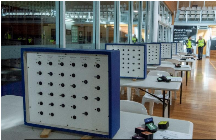
Managing electrical output and use.