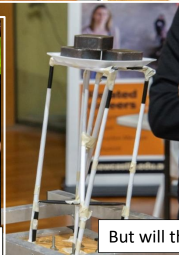
But will they survive an earthquake?