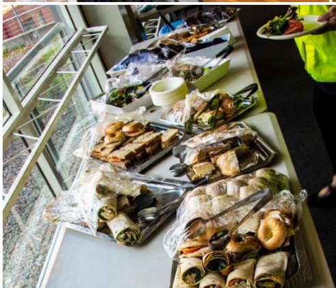
Food to sustain the workers.